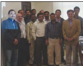
Attendees during the recent TS charter training in the UAE:

In 2008, Moody completed a worldwide series of successful Project Coordinator (PC) charter training programs. A similar program is now currently being released targeted to the Technical Specialists (TS) group. Classroom-based training sessions have already taken place in the USA, Egypt, UK, and Norway. The contents of the Technical Specialist charter training program specifically address the Moody International processes, the corporate standards to which Technical Specialists are expected to adhere as a minimum, and the quality of service expectations within the organization.