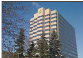
BP Exploration Alaska Offices Anchorage, Alaska

The Technical Staffing Services (TSS) division of Moody International USA is proud to be a prime staffing agency to the British Petroleum Exploration Alaska (BPXA) group, headquartered in Anchorage.